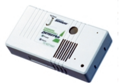
Wireless Carbon Monoxide Sensor 60-652-95