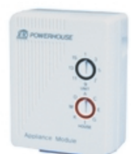
X10 Appliance Module 13-079