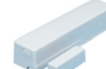
SAW D/W Sensor 60-670-95R