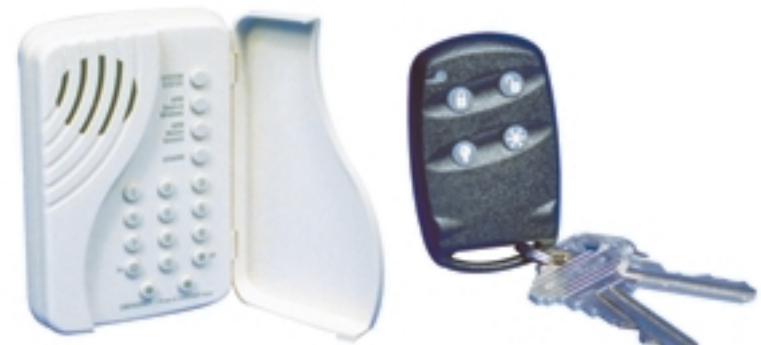
Dialog Talking Touchpad 60-924-3