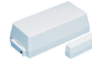
Crystal D/W Sensor 60-362-10-319.5