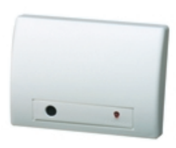
ShatterPro™ Glassbreak Sensor 60-873-95