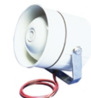
Hardwire Exterior Piezo Siren 13-046