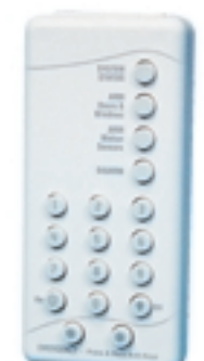
Hand Held Touchpad 60-671-95R