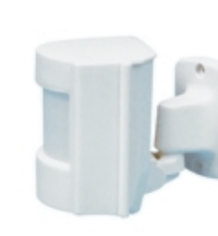
Outdoor PIR Motion Sensor 60-639-95R-OD