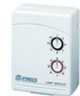
X10 Lamp Module Pro 13-403