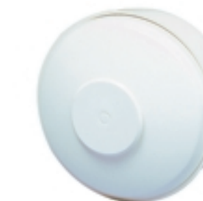
Rate-of-Rise Heat Sensor with Lithium Battery 60-460-319.5-LB