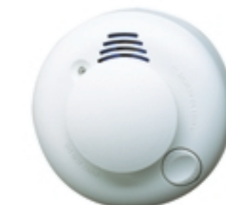
ESL 560 Series Wireless Smoke Sensor 60-848-01-95