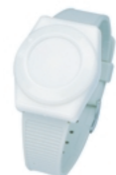
Micro Multi-purpose Panic Sensor 60-906-95