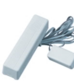
SAW Water Sensor 60-744-95R