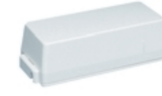
Shock Sensor 60-461-10-319.5