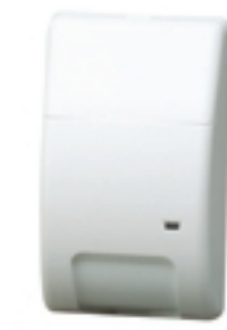
AP750W PIR Motion Sensor 60-880-95