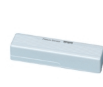
SAW Freeze Sensor 60-742-95R