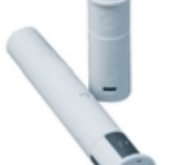
Recessed D/W Sensor 60-741-95