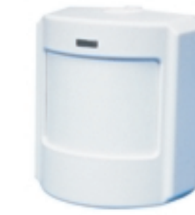
SAW Pet Immune PIR Motion Sensor 60-807-95R