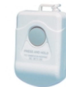
Water-Resistant Pendant Panic Sensor 60-578-10-95